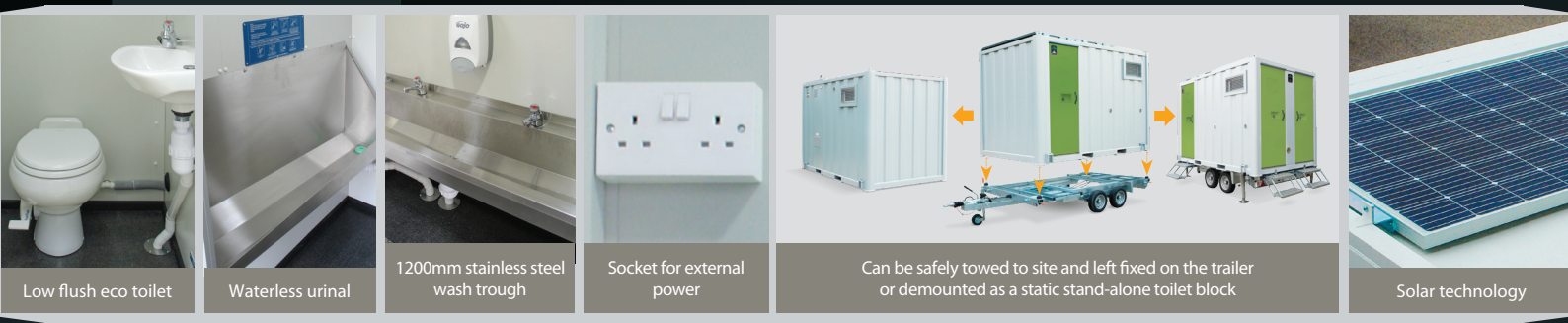
Low flush eco toilet